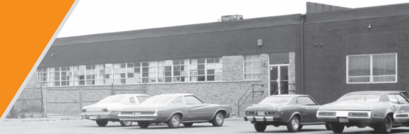
Aero factory circa 1975